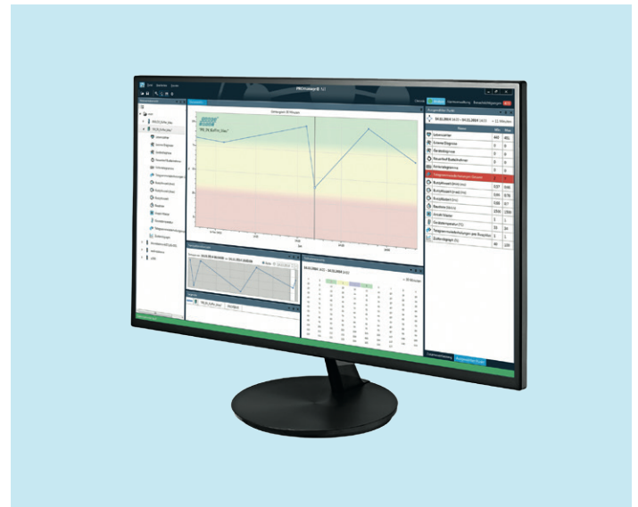
Network management software PROmanage® NT