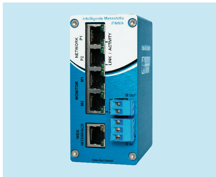
Intelligent Measuring Point iPNMA

For integrating the intelligent PROFINET measuring point into the PROmanage® NT software, 16 licensed ports are required for each iPNMA.