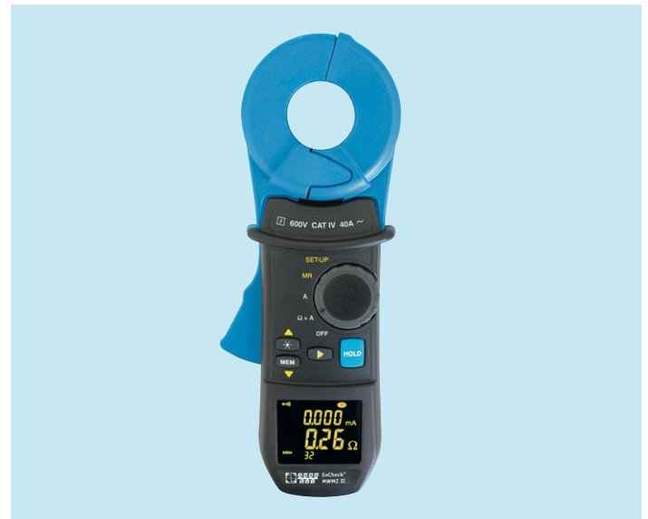
EmCheck® MWMZ II