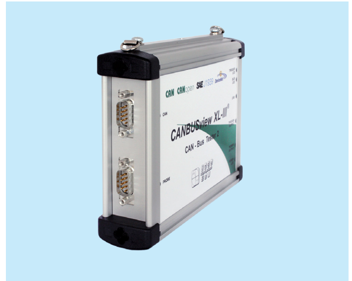
CANBUSview XL III

Parallel to the physical transfer quality determination the CANBUSview XL checks the telegram traffic for defective telegrams, missing acknowledgements and overload of bus devices as well as the general bus capacity utilization. The online trigger is used to analyse the communication quality over several days / weeks. This helps to detect sporadic communication faults and allocate the same to a certain period of time. The online trigger is capable of analysing physical and logical faults.